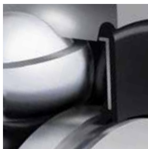
The newly developed NKE double-lip labyrinth seal