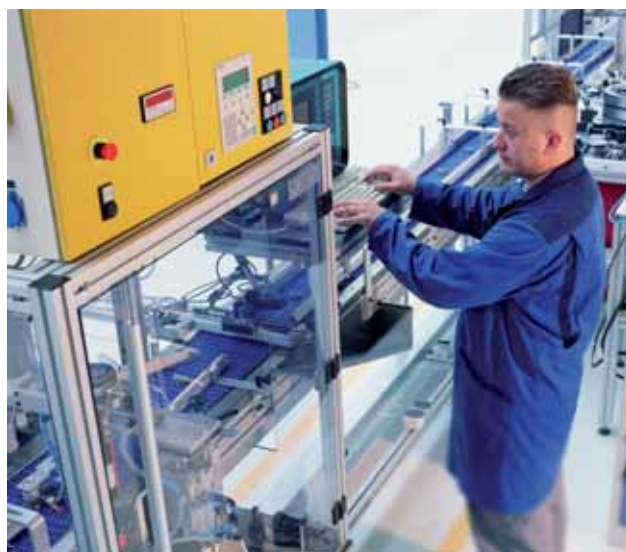
100% noise testing guarantees highest precision.